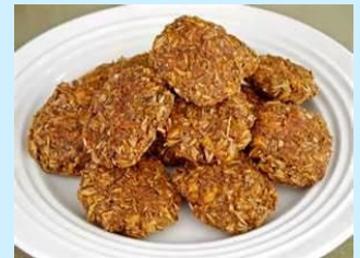
Yummy homemade horse cookies